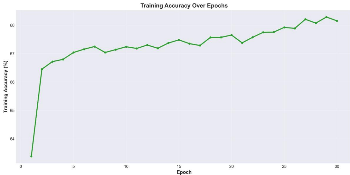
Figure 1. Training accuracy over 30 epochs. The model shows consistent improvement with no sign of convergence plateau.