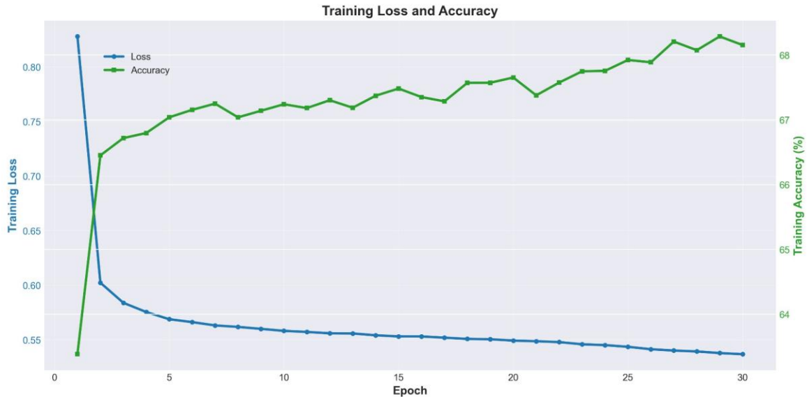
Figure 4. Combined training loss and accuracy. The inverse relationship and slow post-epoch-5 improvement are visible.